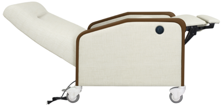
Model: 890902 29W 33D 43H 23SW 20.5SD 19SH 26AH

This treatment chair, outfitted with a power cord, with its 2-button controlled power recline, embodies patient-centered design. An optional push bar allows easy positioning of the chair. Available options include a side folding table and a unique folding arm for effortless patient transfer in and out of the chair.